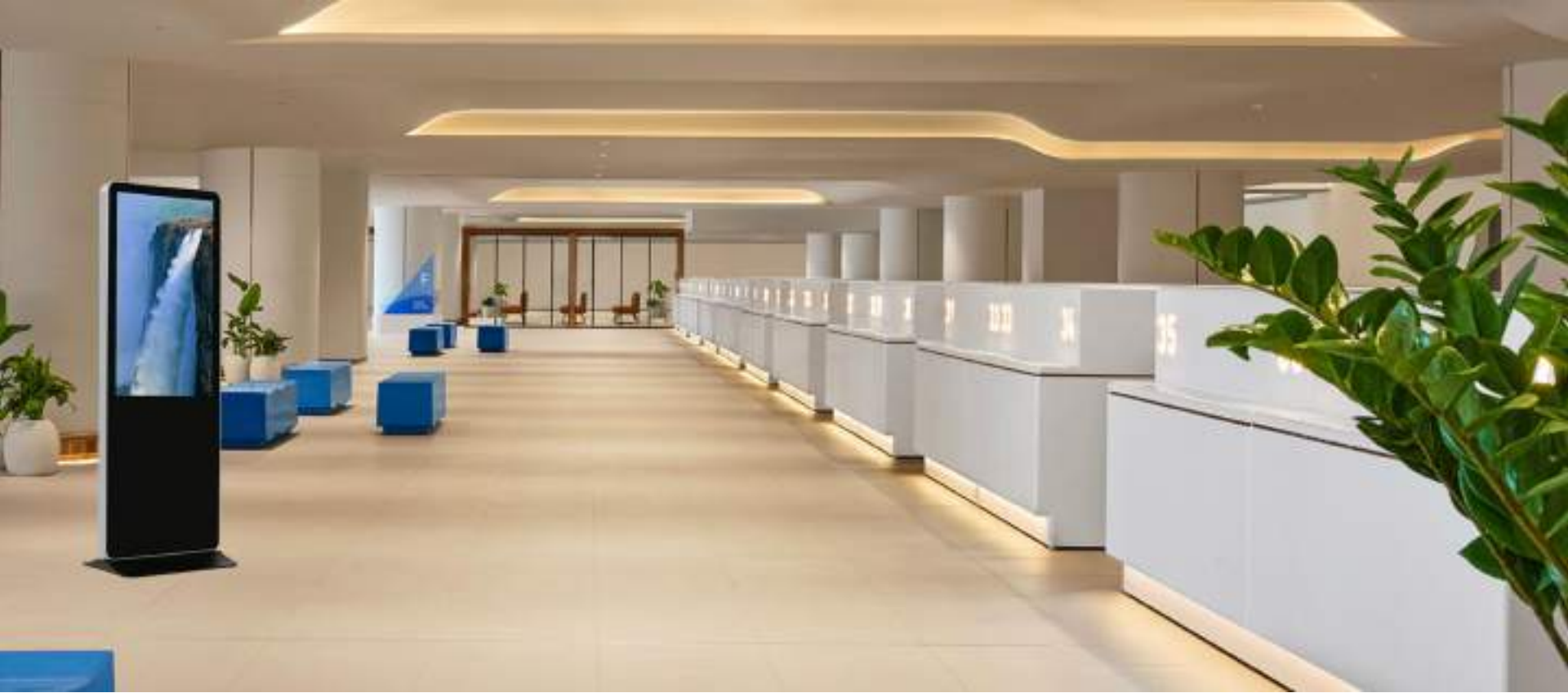
~~~~~ Digital Standee ~~~~~