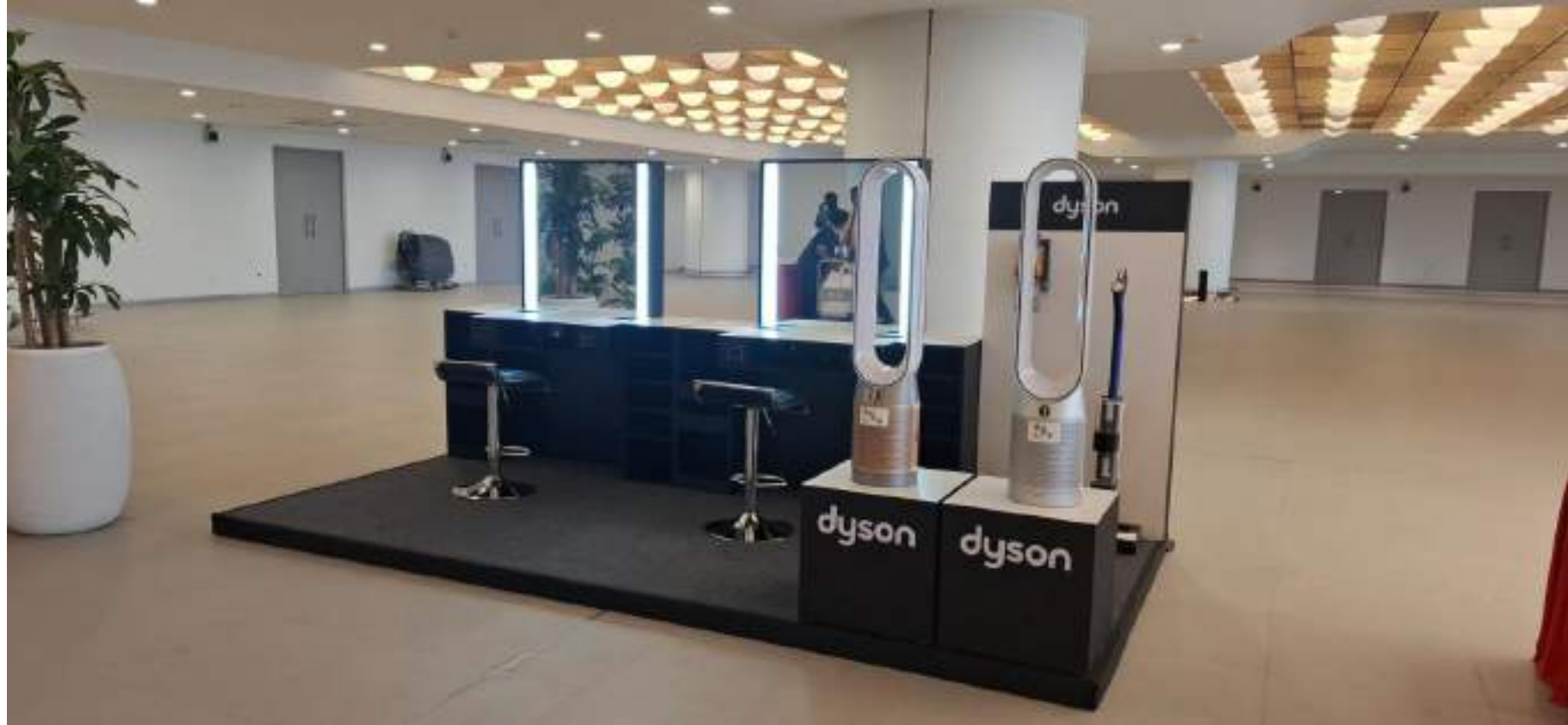
~~~~~ Promotional Display ~~~~~