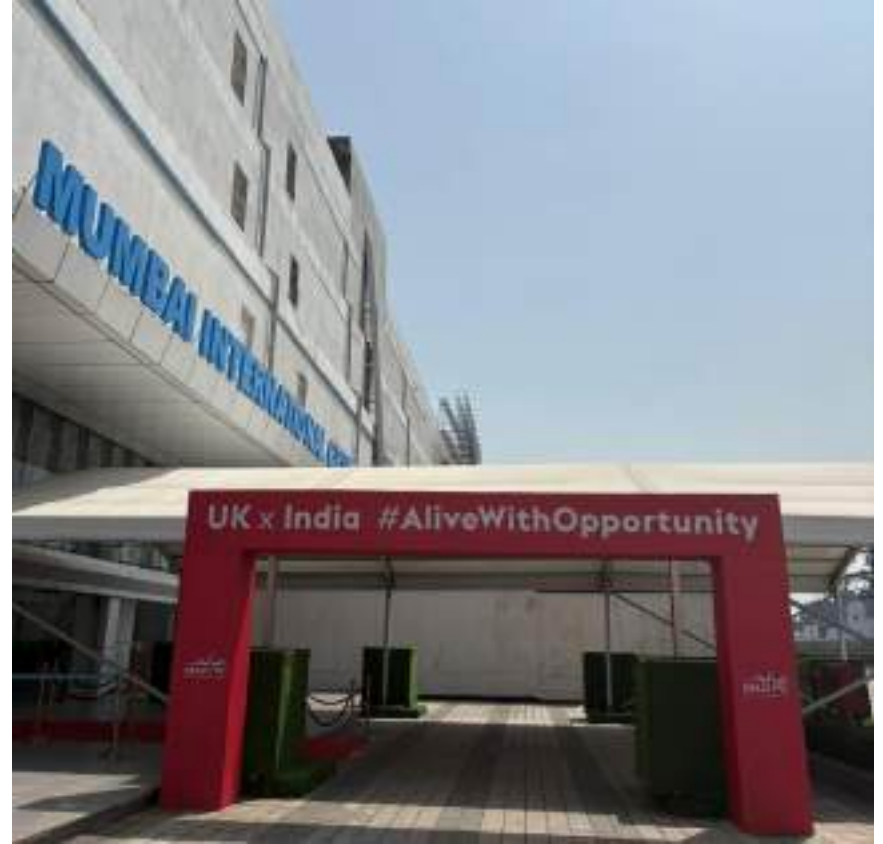
~~~~~ Arch Gate Display ~~~~~