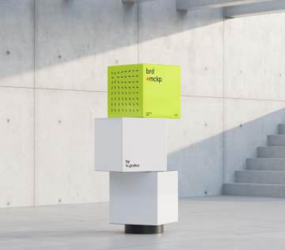
~~~~~ Cube Display ~~~~~