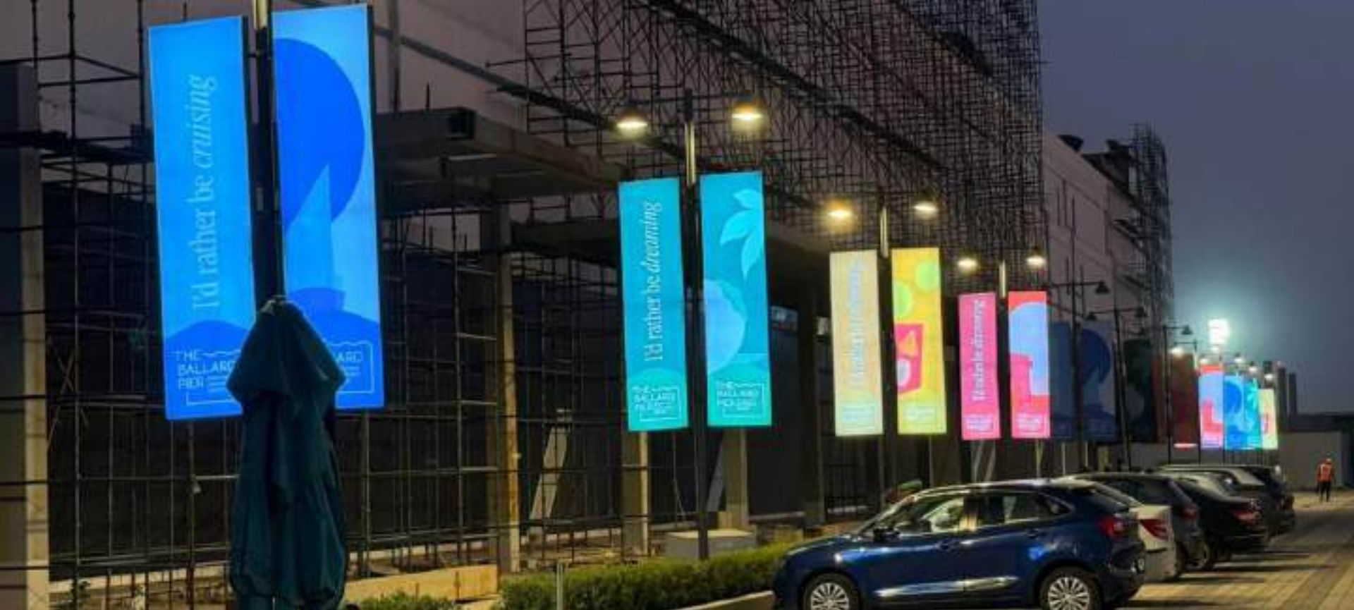
~~~~~ Backlit Flagpoles ~~~~~